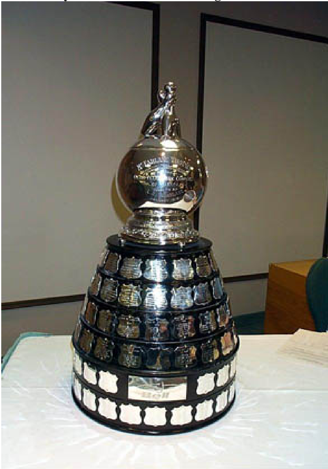
McFarlane Bowling Trophy Le Trophée de Quilles McFarlane