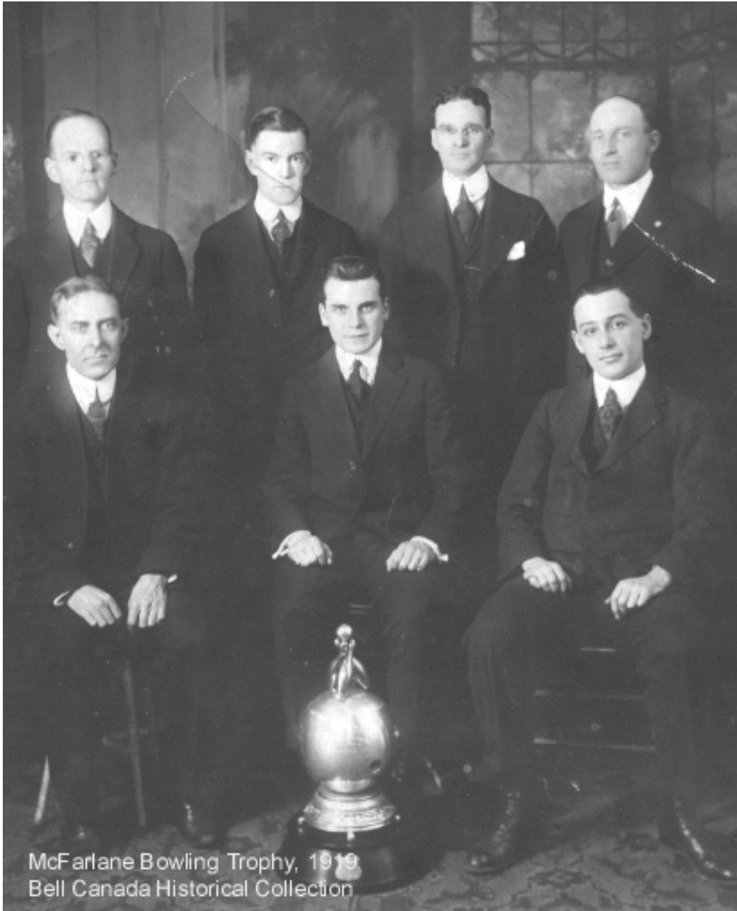
McFarlane Bowling Trophy, 1919 Bell Canada Historical Collection